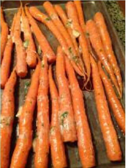
Fresh picked carrots sprinkled with basil are ready to roast.