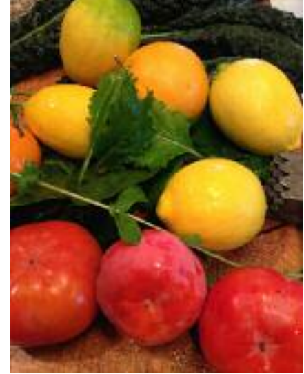
The final crop of persimmons sits on the chopping block with fresh greens and Meyer lemons.